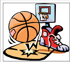
Basketball games will be held in the gym.

the other for boys. Practice will begin September 6, 2011 and the first game will be September 20, 2011.