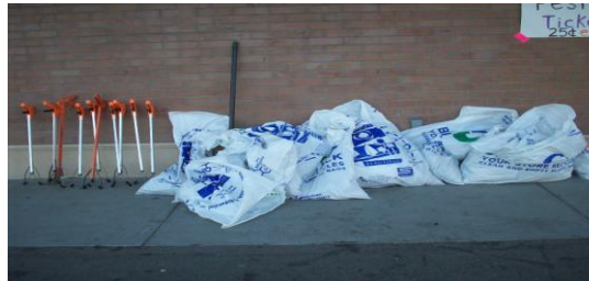
Lights on clean up

On October 20, 2011 The Grant AllStars celebrated Lights on afterschool. We had an assembly where we talked about why afterschool programs are important. The special speakers included The principal 3 parents and 4 Allstar students. Many parents came out to support our assembly which was followed by a school wide and neighborhood clean up at Backesto park. Students were treated to ice cream at the end of the event.